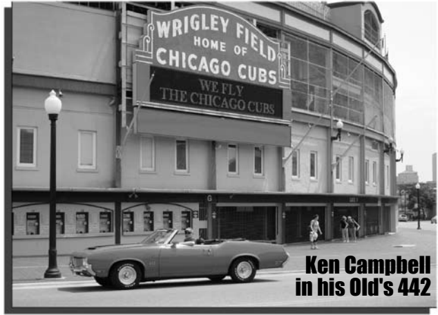
Ken Campbell in his Old's 442

My GT is still relatively stock, but I have made some minor changes. Most modifications have been cosmetic or restoration. I have changed to a Warber hood, upgraded the rear suspension to polyurethane bushings, added a later model Delco radio with cassette player, upper LCD tail lights at roof level, and a trailer hitch receiver. My Formula is in relatively stock condition also with only the Delco radio/CD player and Pioneer speaker being changed.