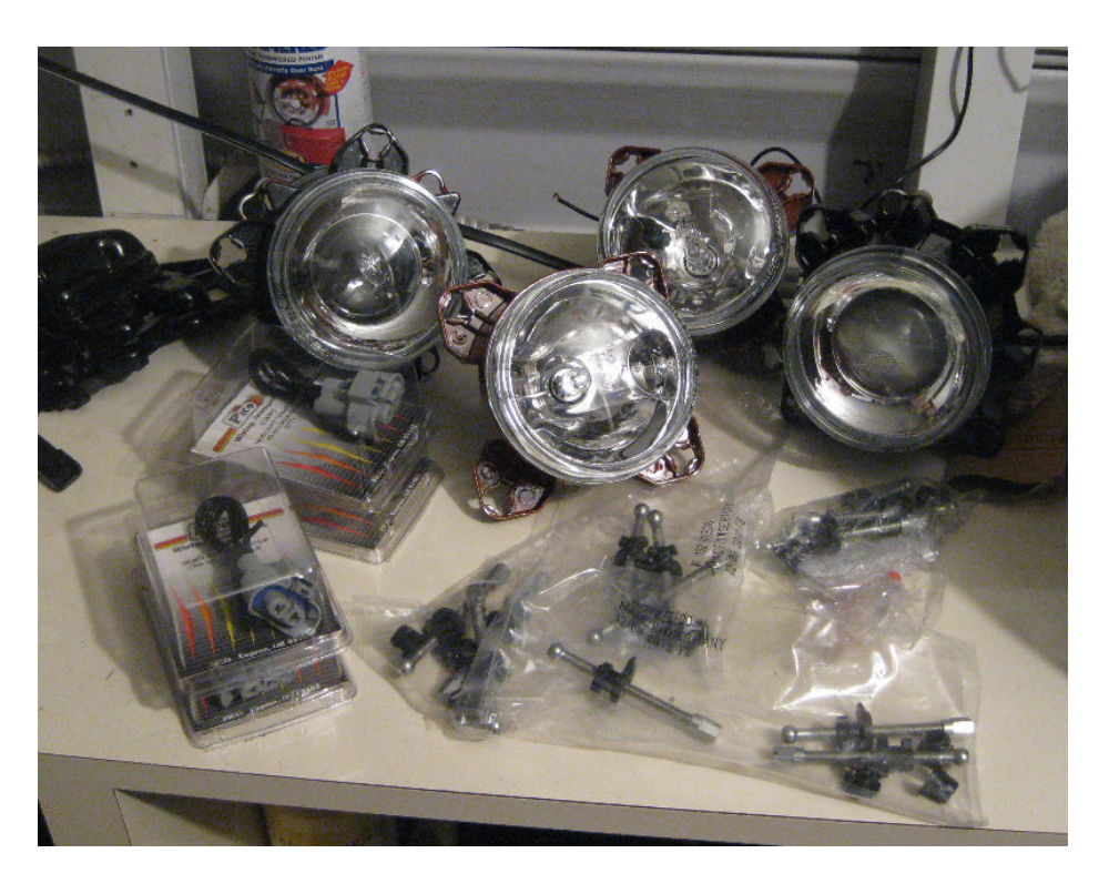
90 MM HEADLIGHTS