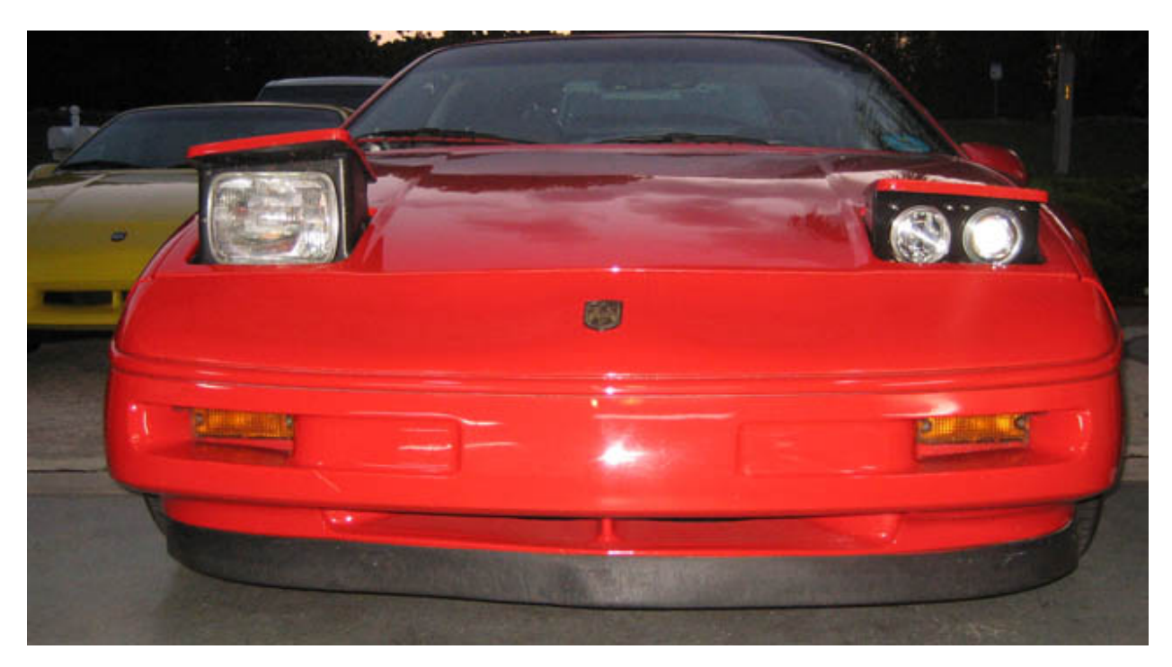
STOCK DELCO HEADLIGHT